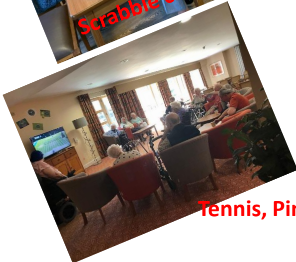
Tennis, Pimm's and scones