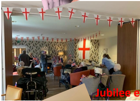
Jubilee entertainment and refreshments